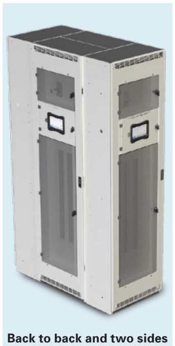
24" x 48"