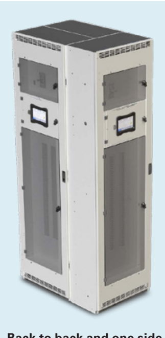
Back to back and one side 24" x 36"