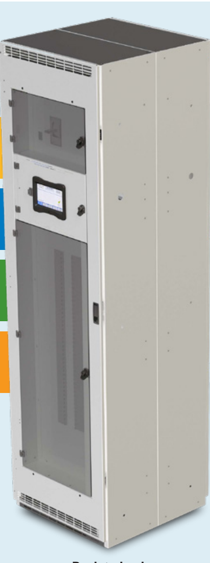
Back to back 24" x 24"

The modular compact remote power panel mounts on-tile and in-tile with standard raised floor systems.