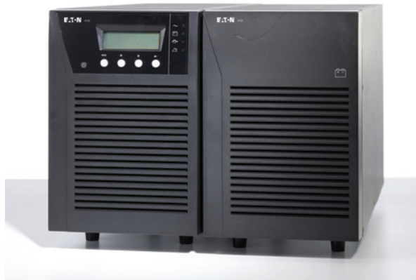
Add up to four EBMs for hours of runtime