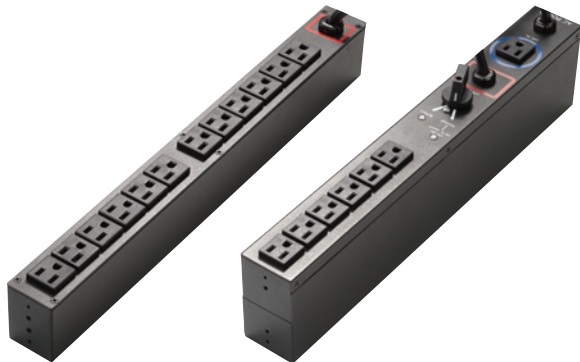
Optional FlexPDU and HotSwap MBP for greater flexibility and uptime