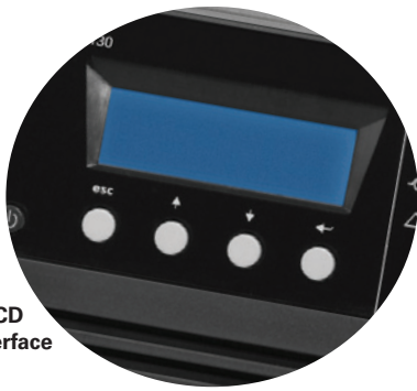
Bright LCD user interface